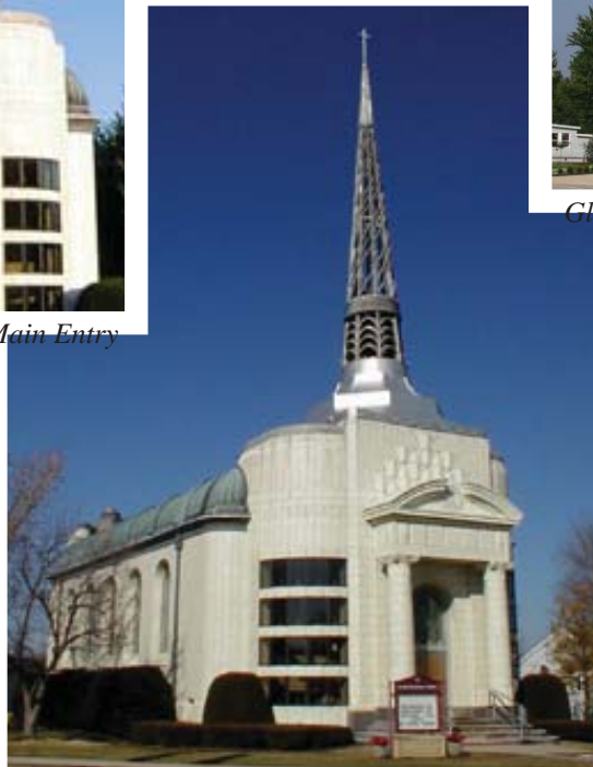
National Register of Historic Places 1995