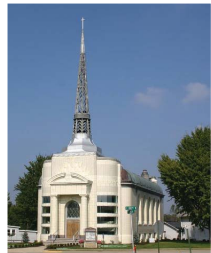
Glaze Brick and Terra Cotta Exterior