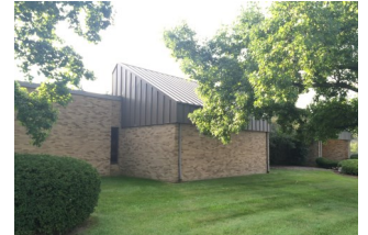
Existing Warren Branch Library

Odle McGuire Shook ARCHITECTURE INTERIOR DESIGN