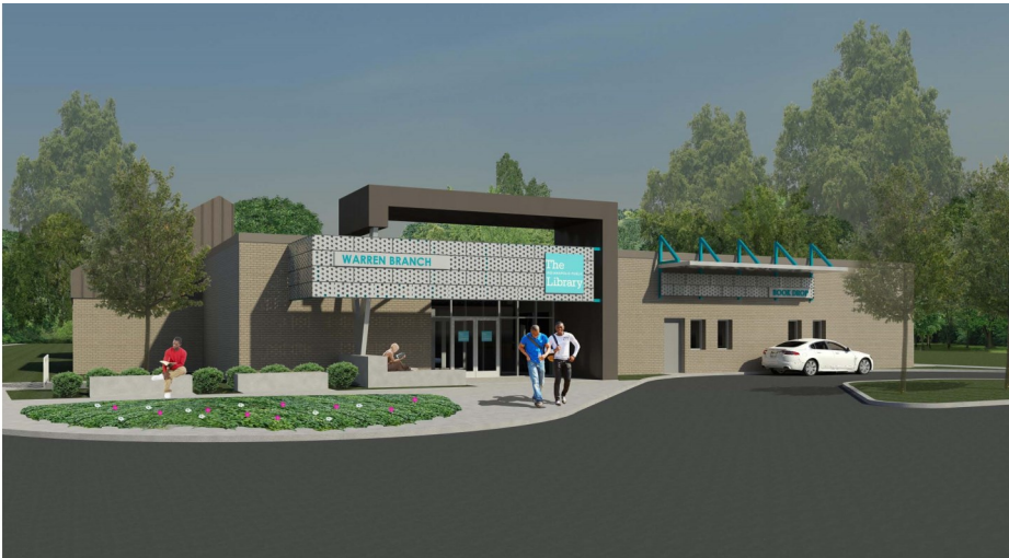
New South Entrance and Book

The Warren Branch of the Indianapolis Public Library System was constructed in 1974. This 15,500 sqft facility is characterized by its tan brick and sloped metal roofs. Due to the changing use of the libraries an emphasis will be the technology throughout the facility. Additionally, the main entry has been relocated to provide direct access from the existing south parking area, including a new auto book drop. The style of the new entrance provides a contemporary update that is complimentary to the existing architectural language. New reconfigured public restrooms, new circulation desk, a new community activity space, new finishes and array of contemporary furniture will enhance the patron experience.